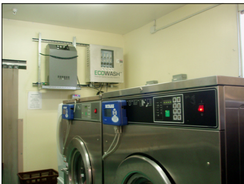
Wall mounting offers convenient & minimal footprint.

Four washers ranging in size from 40 to 60lbs, give the facility the ability to process nearly 210 lbs of laundry at once. Configuration was simple- one Quad Cell unit was installed handling the four washers independently or simultaneously. The ozone system continuously monitors the washers and automatically engages or hibernates until needed.