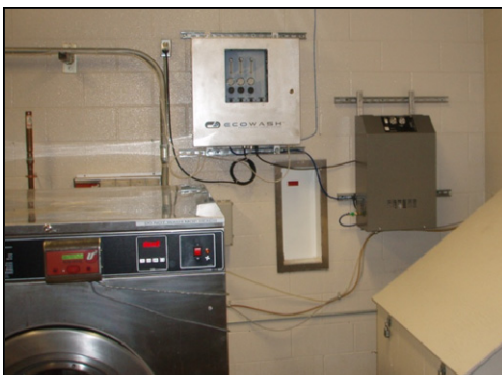
Wall mounting offers convenient & minimal footprint.

Three 80lb washers can process 240 lbs of laundry at once. Configuration was simple- one Triple Cell unit was installed handling all three washers independently or simultaneously. The ozone system continuously monitors the washers and automatically engages when one or more are activated. The Ozone system hibernates until needed.