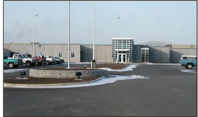
Butler County Kansas Detention Facility

After an Energy Audit conducted by Honeywell identified the laundry as a major consumer of utilities, water and harsh chemicals- the County began looking at ways to improve their laundry while cutting costs. Ozone was the answer! The Ozone Company was consulted and an extensive Saving Analysis was completed outlining past and present performance as well as a Pro Forma for future operations.